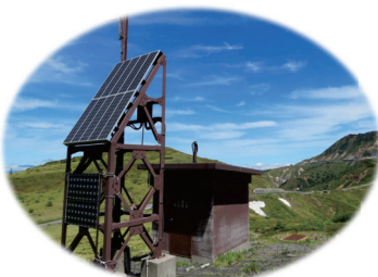
Borehole-type tiltmeter and seismometer station

We design and operate a dense volcano observation network of the Kusatsu-Shirane Volcano Observatory to model shallow subsurface structures that cause phreatic eruptions. In addition, we develop methods for monitoring the hydrothermal system (see the schematic diagram below). We discuss how people who benefit from volcanoes but face threats from volcanoes can deal with volcanoes, in other words, how to increase their resilience.